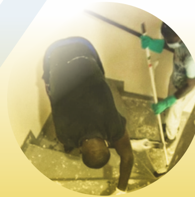
Phase 2 / cleaning 8 floors