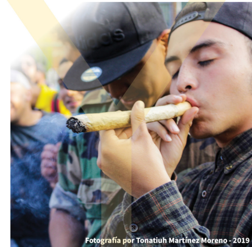
Fotografía por Tonatiuh Martínez Moreno - 2019