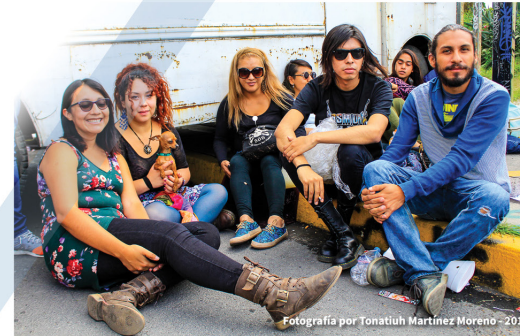
Fotografía por Tonatiuh Martínez Moreno - 2019

The theme of the event was the regularization of the use of marijuana in Mexico. It included an exhibition of art pieces alluding to marijuana. There were 8 musical performances at different times of the festival, including the opening and closing act; 7 roundtable discussions and 2 sessions of cine-debates aimed at encouraging participation from different sectors of the community; 2 creativity workshops, including one directed by Rodrigo Olvera, an artist associated with TRYSACES and another proposed by one of the youths of the community on making stickers. Finally, there was a cannabic-bike tour that followed a 19 km route in the shape of a marijuana leaf through several neighbourhoods in Iztapalapa and Ciudad Nezahualcōyotl.